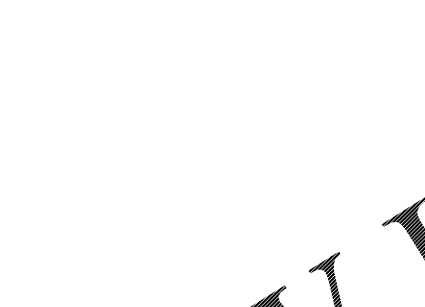
2 ELECTRICAL DEVICES - DWELLING UNIT KITCHEN Scale: NOT TO SCALE

FAIR HOUSING NOTES ALL WORK SHALL BE INSTALLED IN STRICT ACCORDANCE WITH THE HUD FAIR HOUSING ACCESSIBILITY GUIDELINES (FHAG), AND AMERICANS WITH DISABILITIES ACT ACCESSIBILITY GUIDELINES (ADAAG) TITLE III. 1.1.1. LIGHT SWITCHES (WITH THE TOGGLE SWITCH IN THE "ON" POSITION) MUST NOT EXCEED A MAXIMUM OF 48" A.F.F. 1.1.2. ALL OUTLETS (POWER OR DATA) AND SWITCHES OVER THE KITCHEN AND BATHROOM COUNTERTOPS MUST NOT EXCEED A MAXIMUM OF 44" A.F.F. TO THE CENTERLINE OF THE OUTLET. 1.1.3. IN L OR U SHAPED KITCHENS, AT LEAST ONE (1) OUTLET MUST BE CENTERED A MINIMUM OF 36" FROM EACH INSIDE CORNER. 1.1.4. IN L OR U SHAPED KITCHENS, IF OTHER DEVICES ARE PLACED ON AN INSIDE CORNER, THEN THEY SHALL BE MOUNTED A MINIMUM OF 36" FROM AN INSIDE CORNER. 1.1.5. SIDEWALL OUTLETS AT THE VANITY COUNTERTOPS SHALL BE CENTERED A MINIMUM OF 18" FROM INSIDE WALL CORNER. IF THE OUTLETS ARE MOUNTED ON THE MIRROR WALL, THEN THE WALL OUTLET SHALL BE A MINIMUM OF 24" FROM THE INSIDE WALL CORNER TO PROVIDE A PARALLEL APPROACH. 1.1.6. WALL OUTLETS MUST BE INSTALLED A MINIMUM OF 15" A.F.F. TO THE CENTER LINE OF THE BOTTOM OUTLET. 1.1.7. TOP OF THE THERMOSTATS SHALL BE MOUNTED NO HIGHER THAN 48" A.F.F. IN ALL UNITS AND COMMON AREAS.