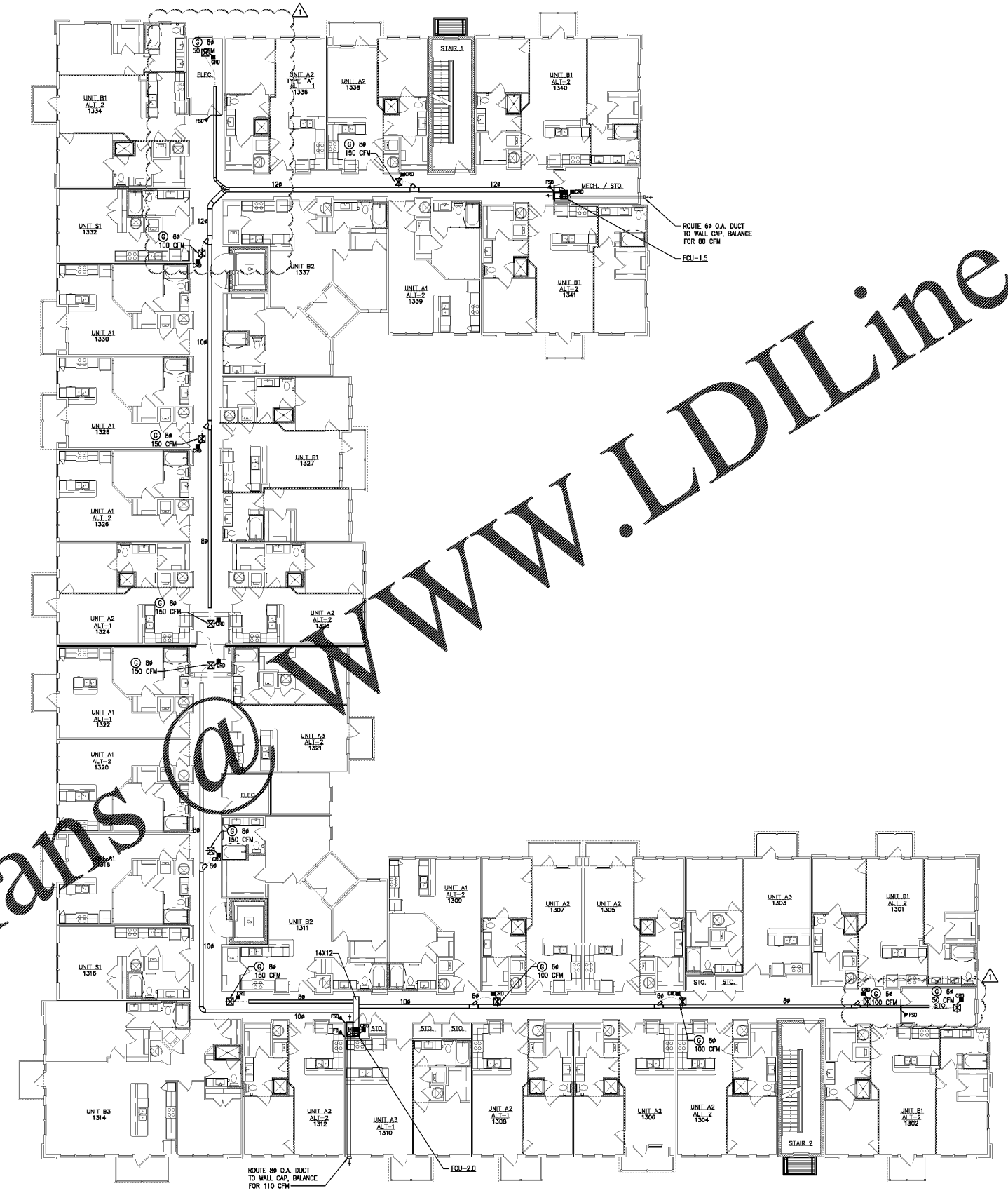
1 Building 1 - Third Level Scale: 3/32" = 1'-0"