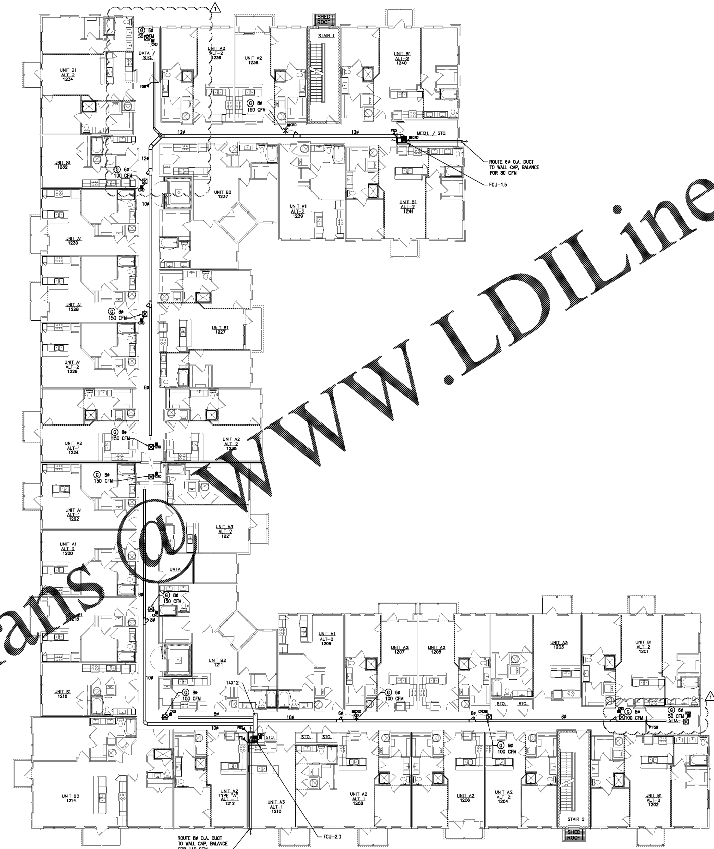
1 Building 1 - Second Level Scale: 3/32" = 1'-0"