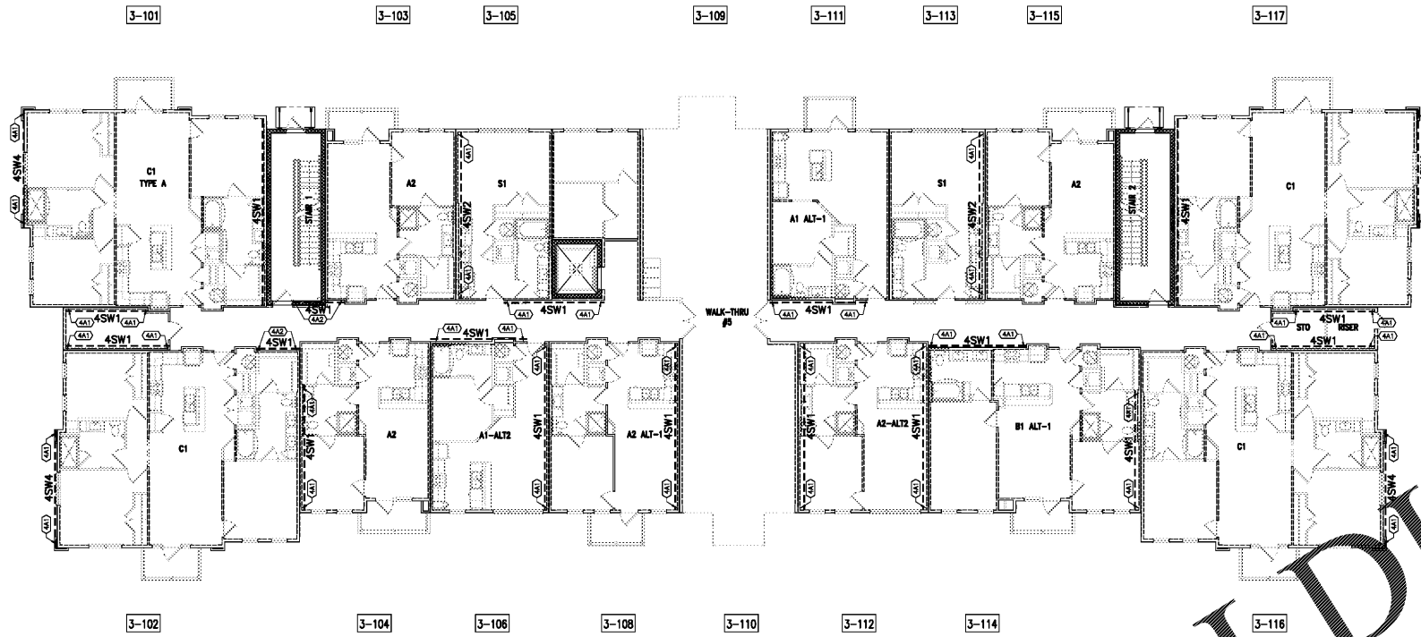
1 BUILDING 3 - 1st FLOOR BRACING PLAN