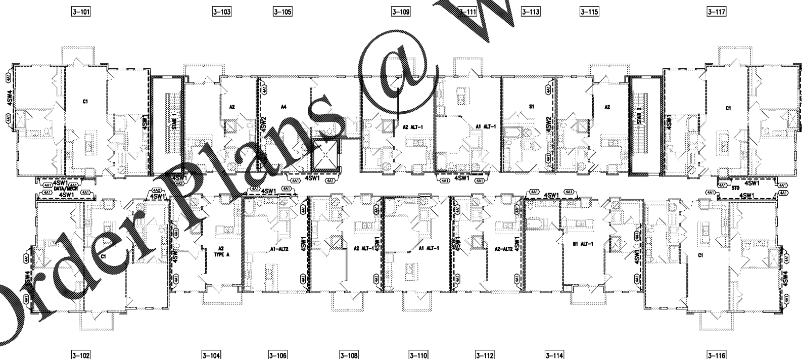
2 BUILDING 3 - 2nd & 3rd FLOOR BRACING PLAN