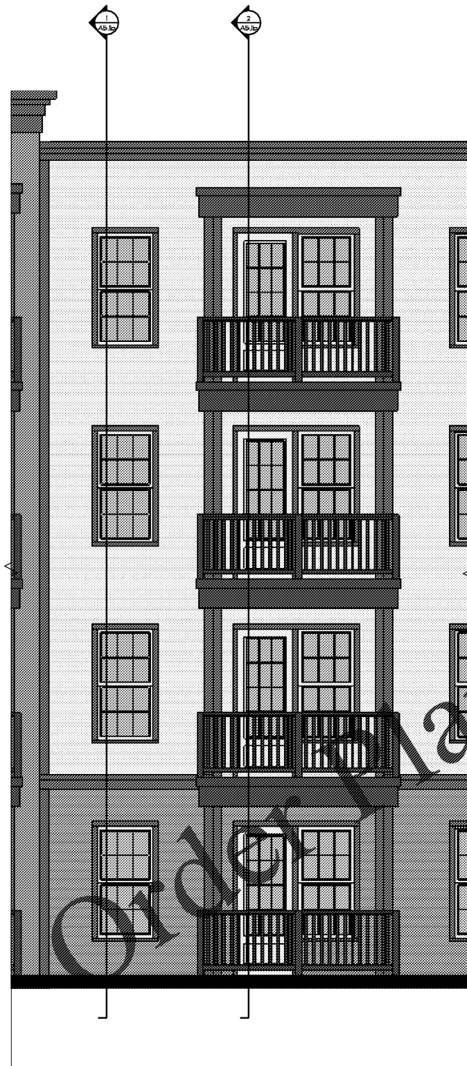
3 Partial Exterior Elevation - Building 1 Scale: 3/8"=1'-0"