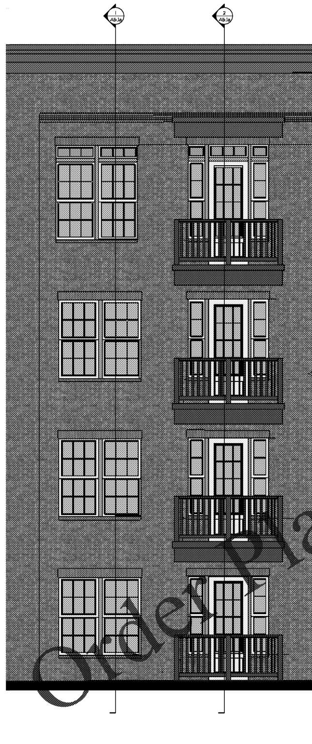
3 Partial Exterior Elevation at Brick Croner - Building 1 Scale: 3/8"=1'-0"