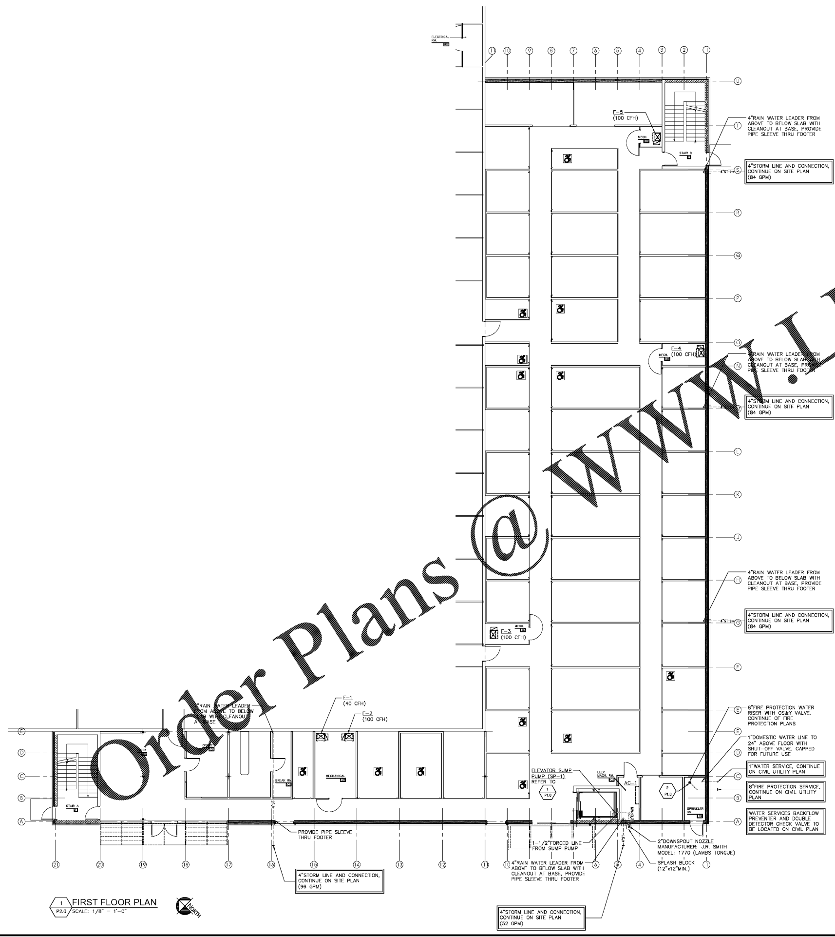
1 FIRST FLOOR PLAN P2.0 SCALE: 1/8" = 1'-0"