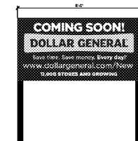
THIS SIGN IS TO BE PROVIDED AND INSTALLED BY THE DEVELOPER OR CONTRACTOR AT THE BEGINNING OF CONSTRUCTION PROJECT.

NOTE: SIGNAGE SHALL BE REVIEWED AND PERMITTED SEPARATELY.