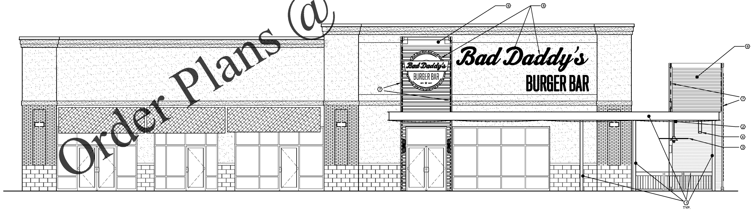
2 EXTERIOR ELEVATION: SOUTH (ENTRANCE) 1/4" = 1'-0" NOTE: