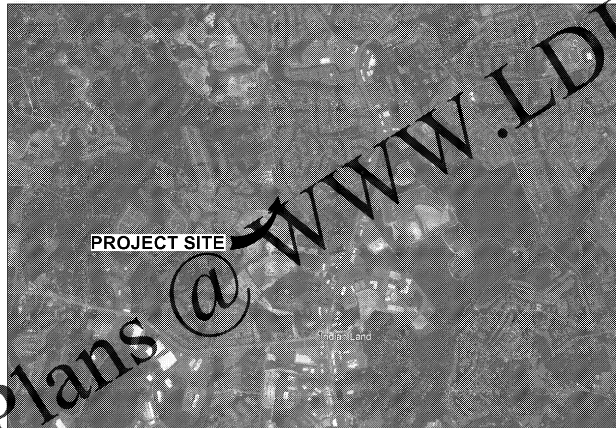
NOTE: SITE IMAGE PROVIDED BY GOOGLE EARTH, PRO, 2016.