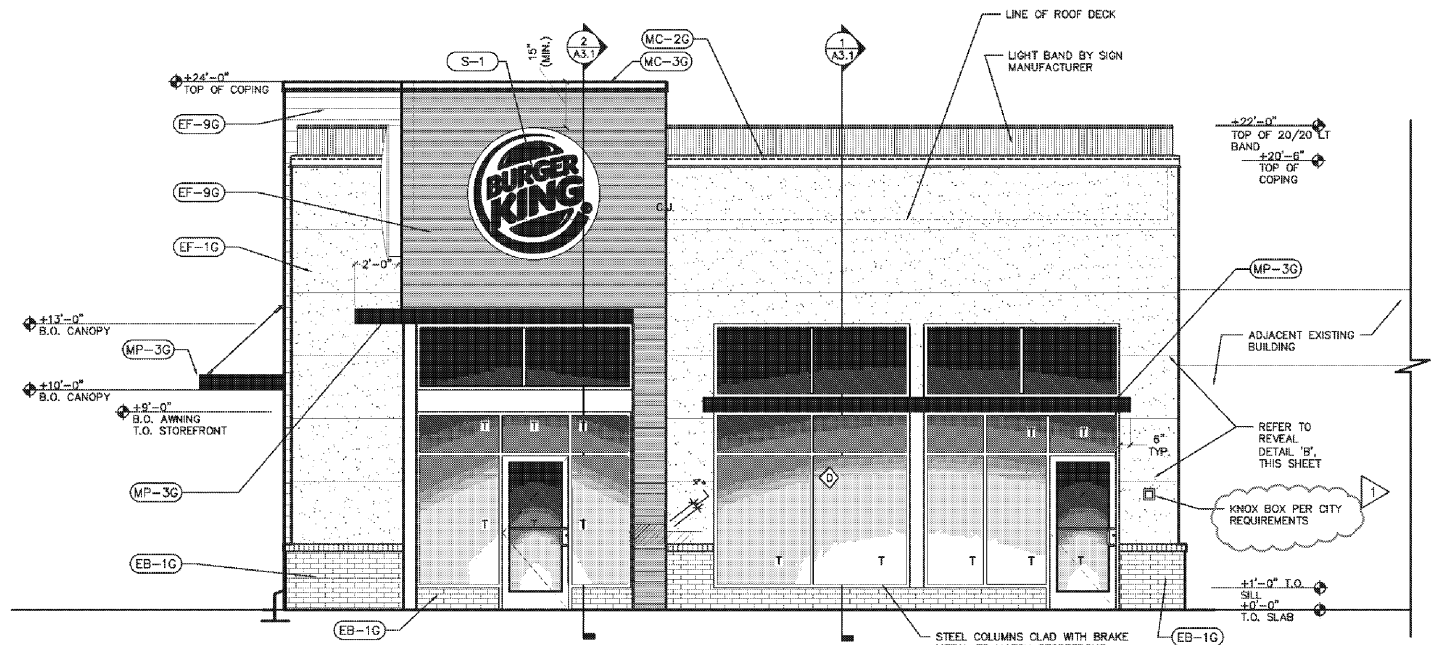
1 FRONT ELEVATION A2.1 SCALE: 1/4" = 1'-0"

NOTES: SUBMIT PRODUCT LINE AND FULL RANGE OF MANUFACTURER'S COLORS FOR OWNER'S APPROVAL.