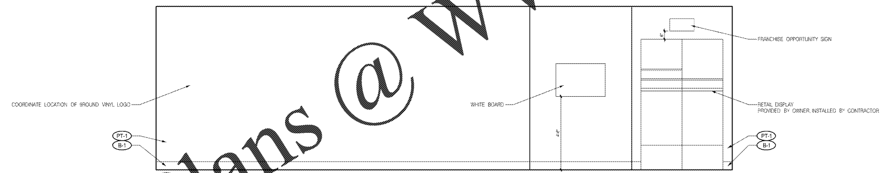
3 INTERIOR ELEVATION A4.00 SCALE: 3/8" = 1'-0"