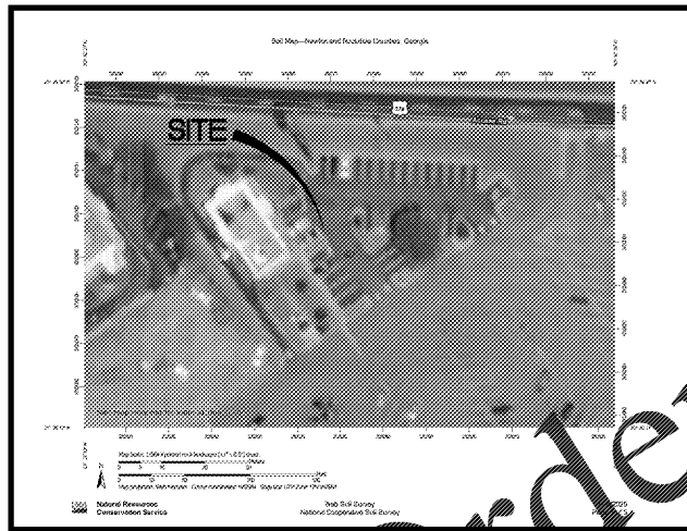
SOILS MAP (NOT TO SCALE)