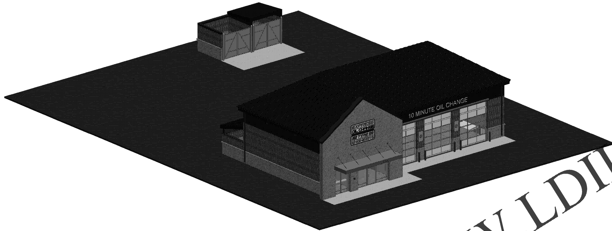
① 3D From Front