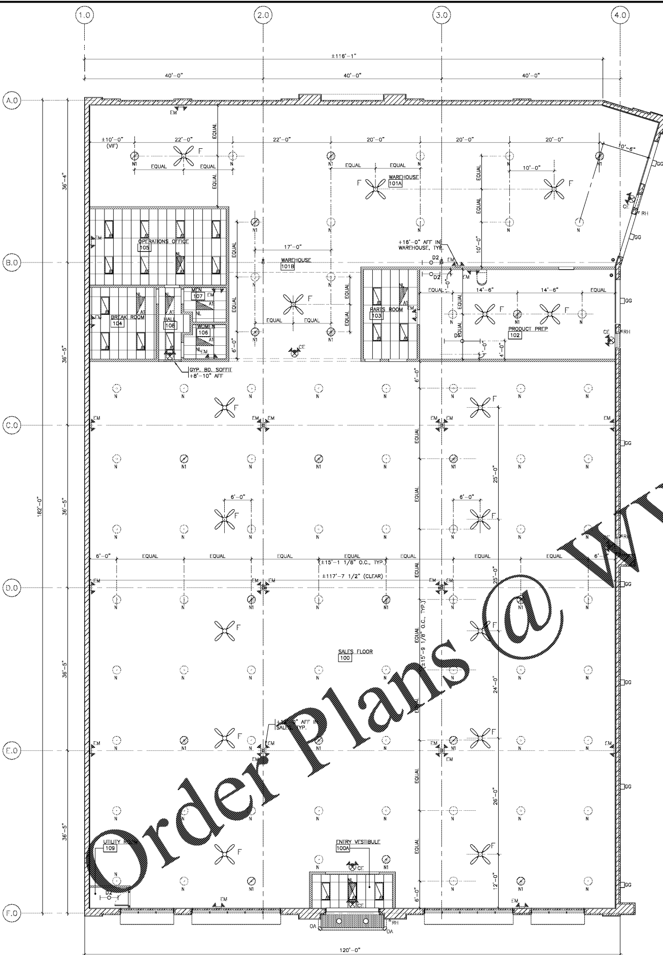
1 REFLECTED CEILING PLAN 1/8" = 1'-0" NORTH