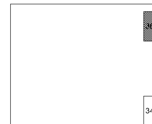
4 KEY PLAN NO SCALE NOTE: PLANS ARE ROTATED 90 DEGREES