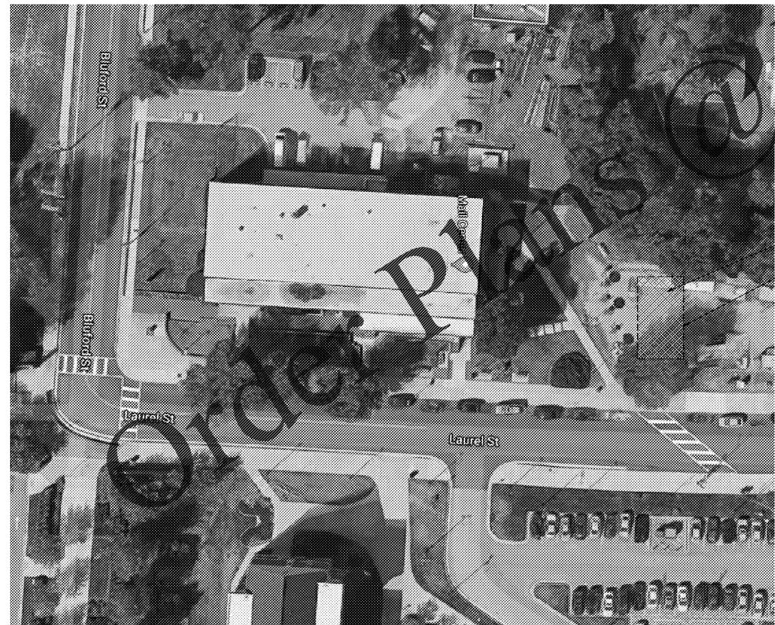
2 STAGING AND LAYDOWN AREA 1" = 30'-0"