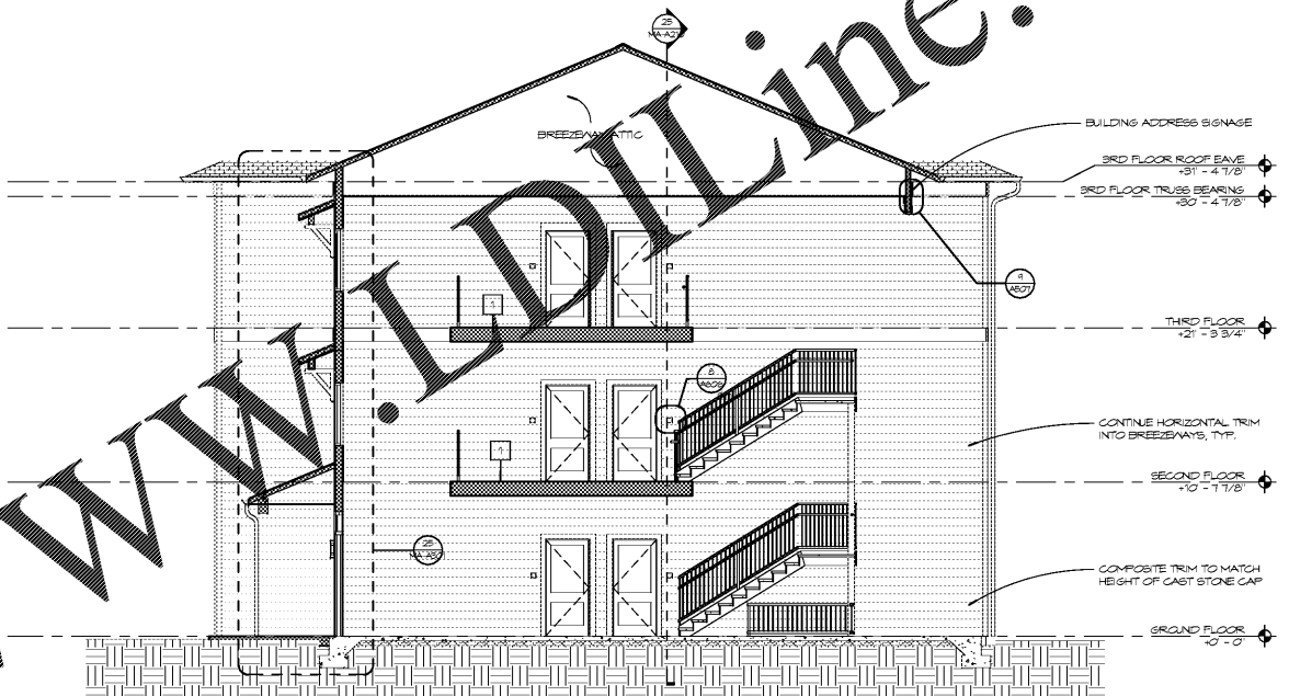
16 TRANSVERSE SECTION 1 SCALE: 3/16" = 1'-0"