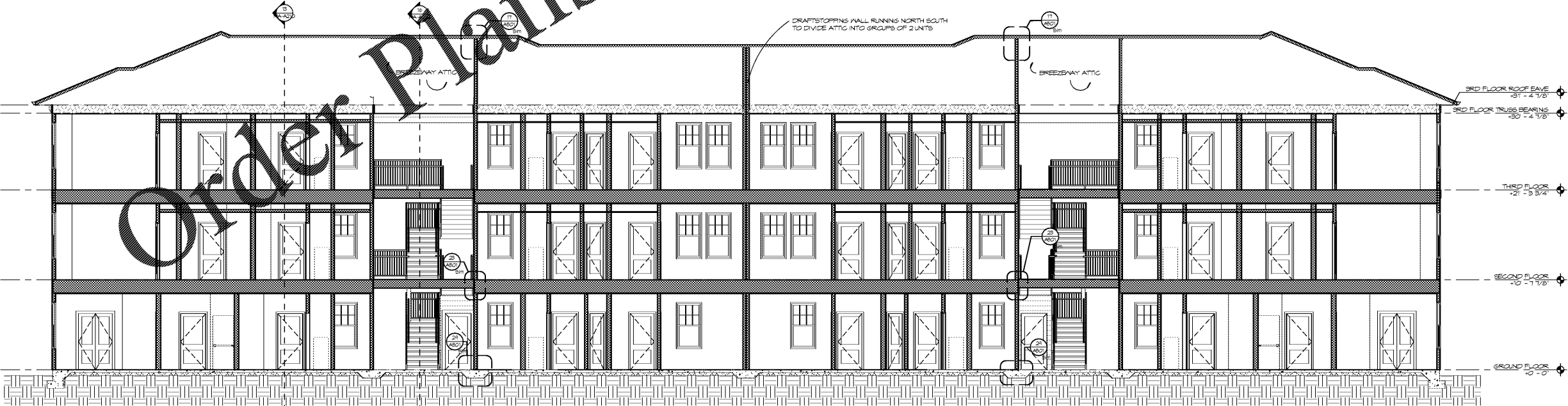
25 LONGITUDINAL SECTION 1 SCALE: 3/16" = 1'-0"