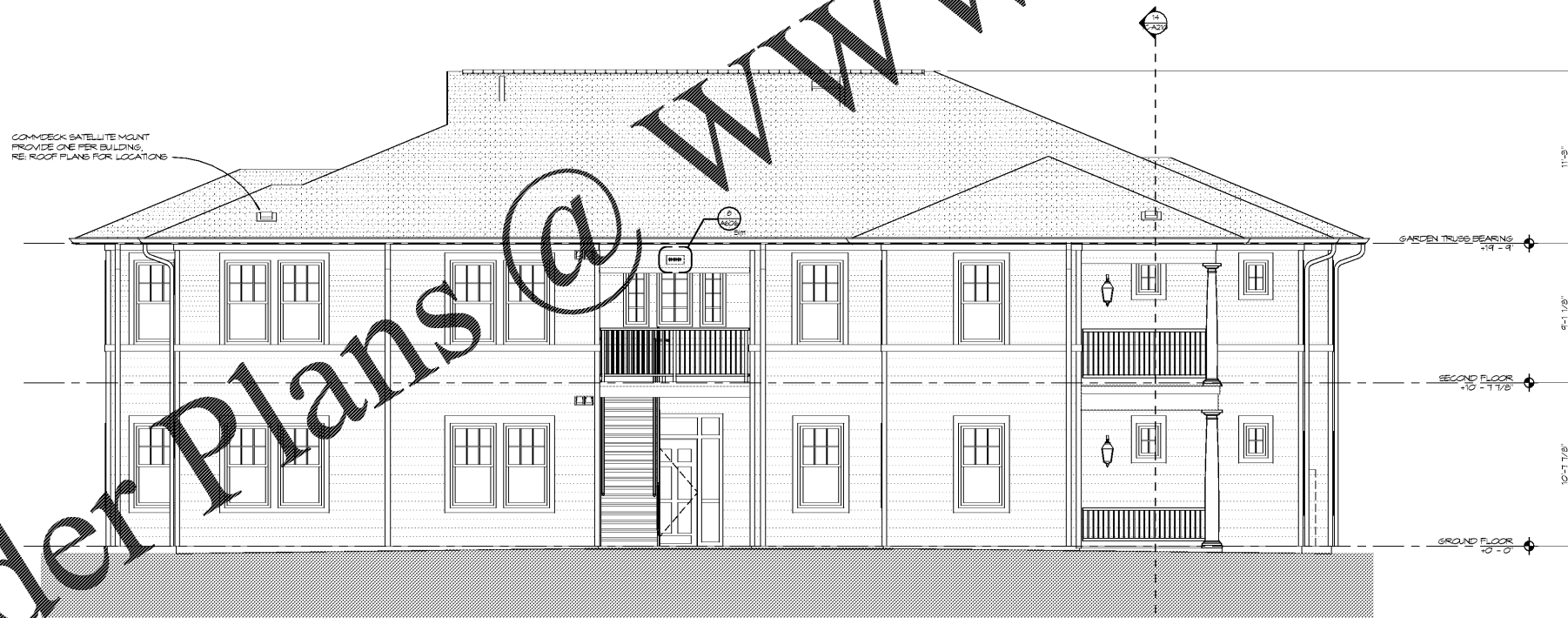
20 IC - REAR ELEVATION SCALE: 1/4" = 1'-0"