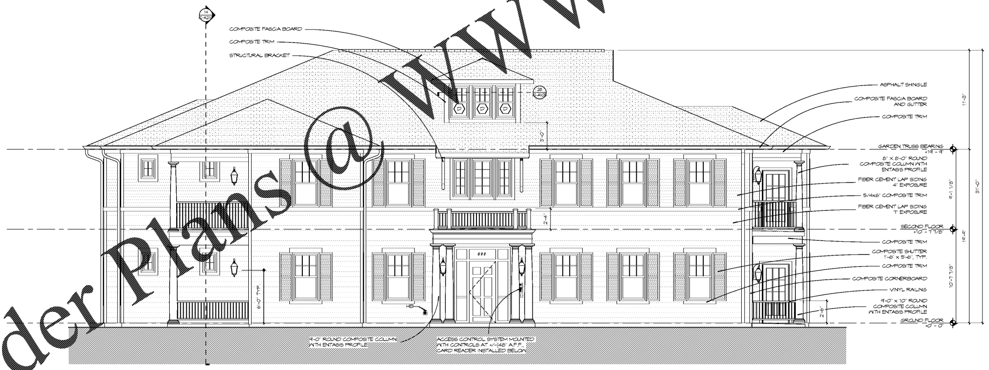
26 IC - FRONT ELEVATION SCALE 1/4" = 1'-0"