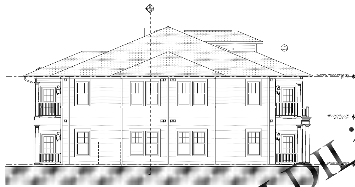
14 IC - LEFT ELEVATION SCALE 1/4" = 1'-0"