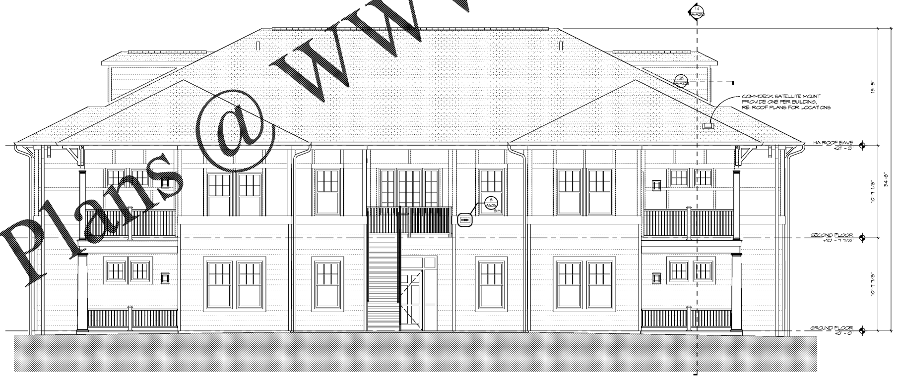
26 HA - REAR ELEVATION SCALE: 1/4" = 1'-0"