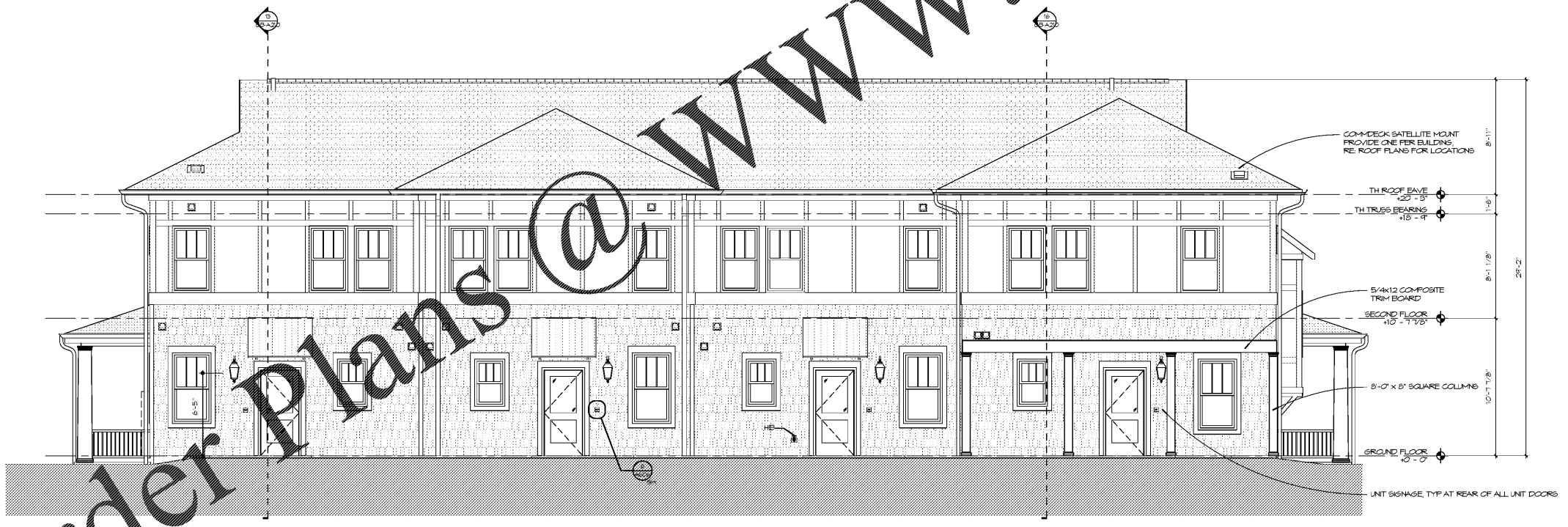
15 GB - REAR ELEVATION SCALE 1/4" = 1'-0"