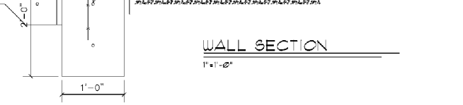
WALL SECTION 1"=1'-0"