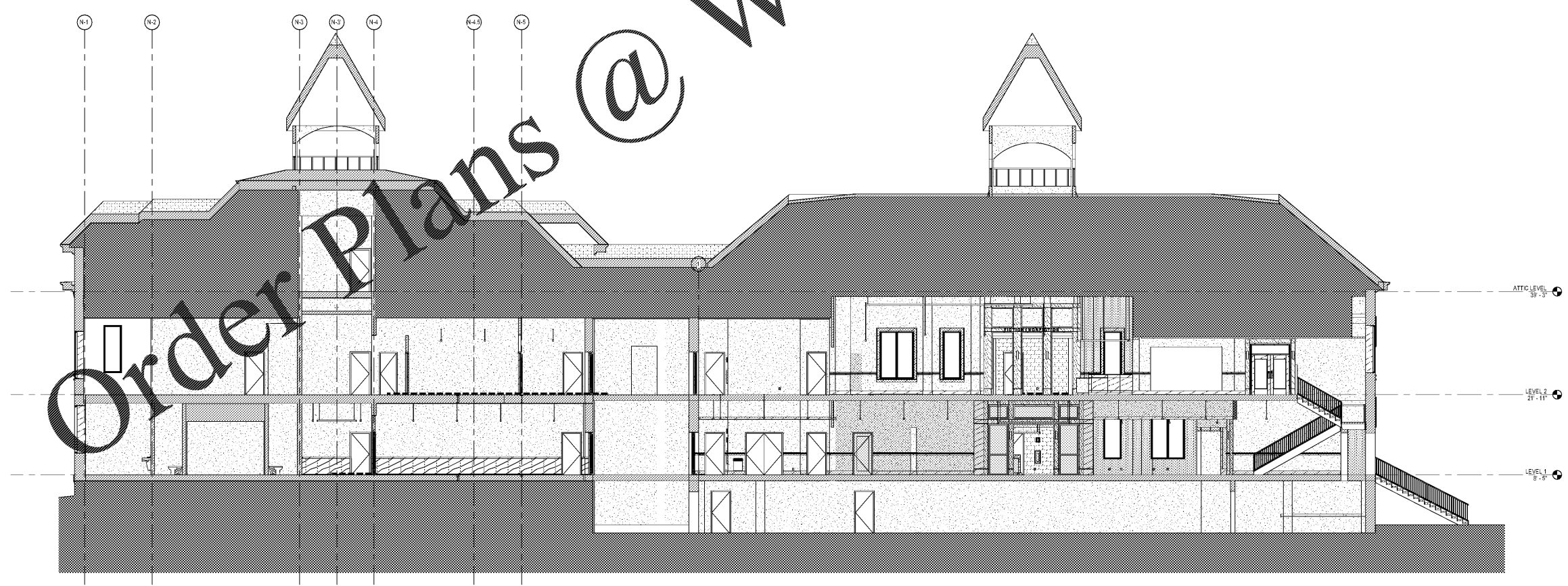
BUILDING LONGITUDINAL SECTION AT CORRIDOR 1/8" = 1'-0"

ALL RIGHTS RESERVED. NO PART OF THIS DOCUMENT IS TO BE REPRODUCED OR TRANSMITTED IN ANY FORM OR BY ANY MEANS, ELECTRONIC OR MECHANICAL, INCLUDING PHOTOCOPYING, RECORDING, OR BY ANY INFORMATION STORAGE AND RETRIEVAL SYSTEM, WITHOUT THE WRITTEN PERMISSION OF THE ARCHITECT. THE ARCHITECT'S LIABILITY IS LIMITED TO THE PROFESSIONAL SERVICES PROVIDED HEREIN. THE ARCHITECT DOES NOT WARRANT THE ACCURACY OF ANY INFORMATION PROVIDED BY OTHERS. THE ARCHITECT'S LIABILITY IS LIMITED TO THE PROFESSIONAL SERVICES PROVIDED HEREIN. THE ARCHITECT DOES NOT WARRANT THE ACCURACY OF ANY INFORMATION PROVIDED BY OTHERS.