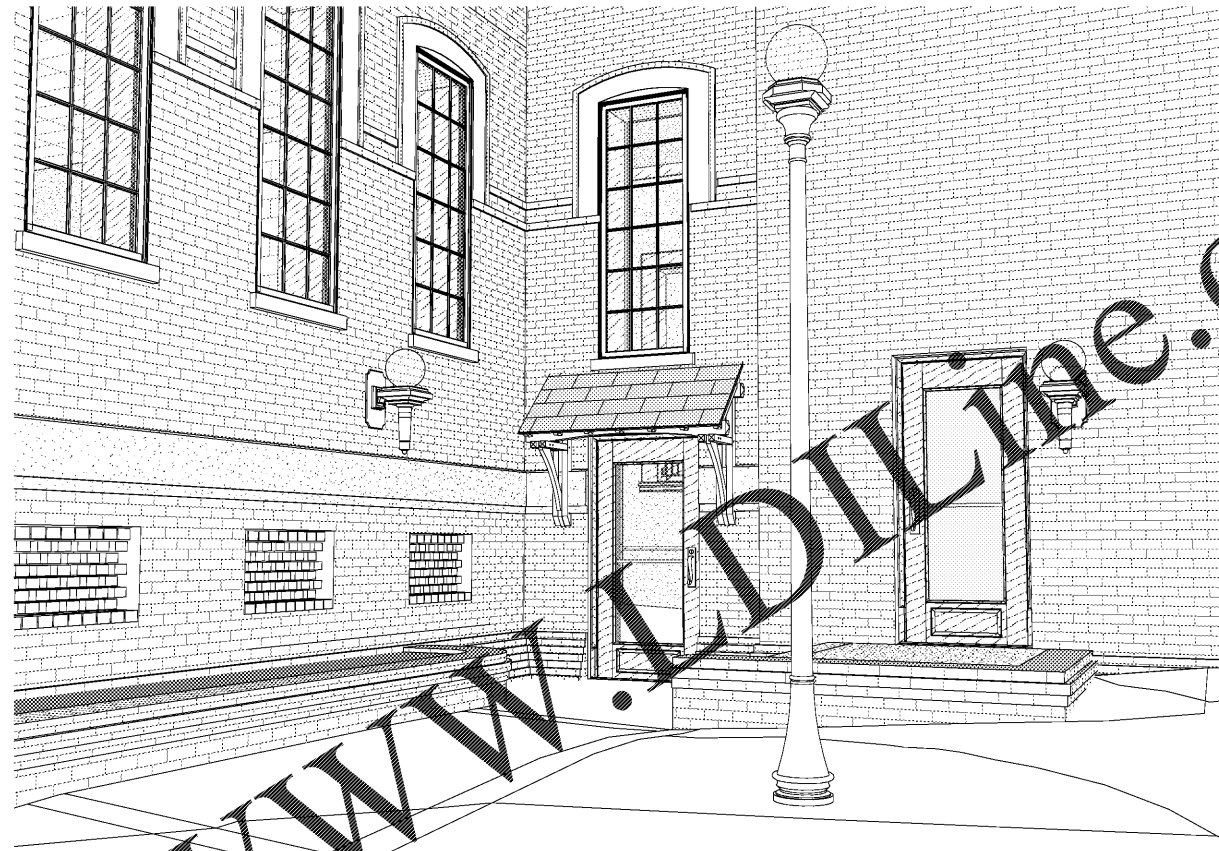
PERSPECTIVE - ACCESSIBLE ENTRANCE