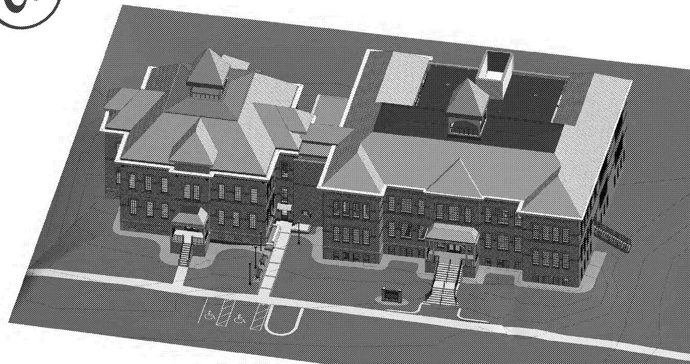
PRESENTATION AXON - COVER SHEET