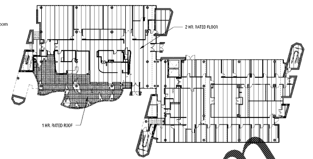
SCHEMATIC CODE KEY PLAN BASE BID 1/32" = 1'-0"