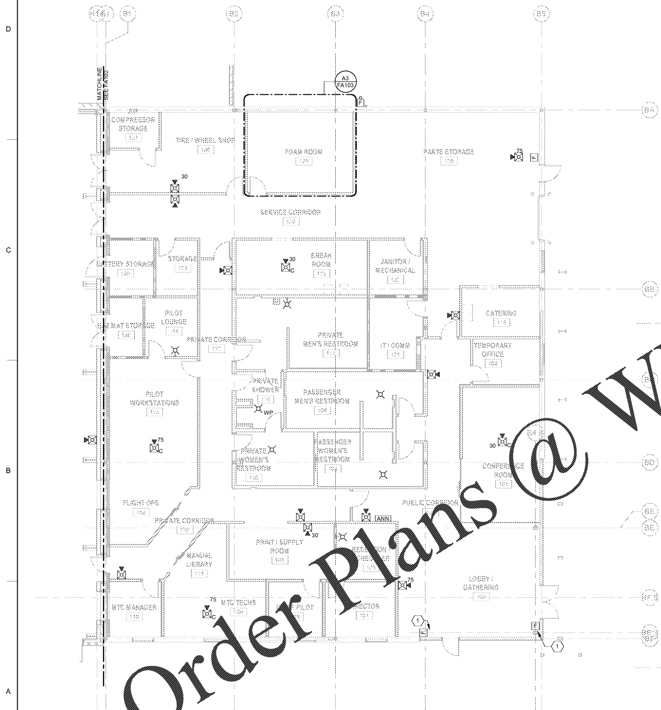
A1 FIRE ALARM PLAN - OFFICES SCALE: 1/8" = 1'-0"

GENERAL NOTES 1. SEE SHEET F-001 FOR GENERAL NOTES AND LEGEND.