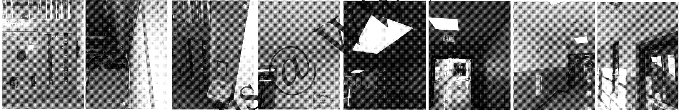
EXISTING MAIN SWITCHBOARD LOCATED IN BOILER ROOM. EXISTING INTERIOR WALL OF BOILER ROOM. EXISTING INTERIOR WALL OF BOILER ROOM. EXISTING EXTERIOR WALL OF BOILER ROOM. EXISTING HALLWAY WALL AND CEILING OUTSIDE OF BOILER ROOM. EXISTING DOOR IN HALLWAY OUTSIDE OF BOILER ROOM. EXISTING DOOR IN HALLWAY OUTSIDE OF BOILER ROOM. EXISTING INTERIOR WALL, EXTERIOR DOOR LEADS TOWARD MULTI-PURPOSE BUILDING.