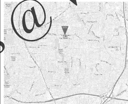
WADSWORTH MAGNET SCHOOL DISTRICT MAP