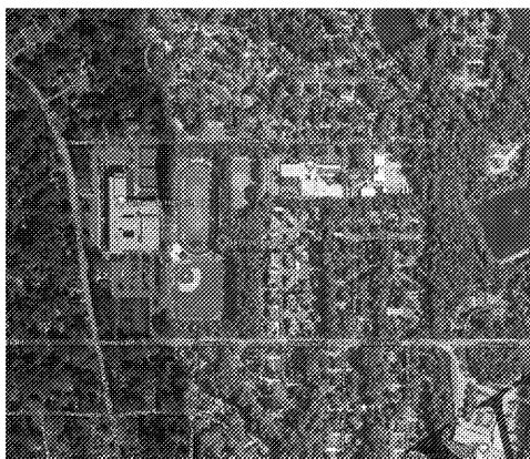
VANDERLYN ELEMENTARY SCHOOL AERIAL MAP