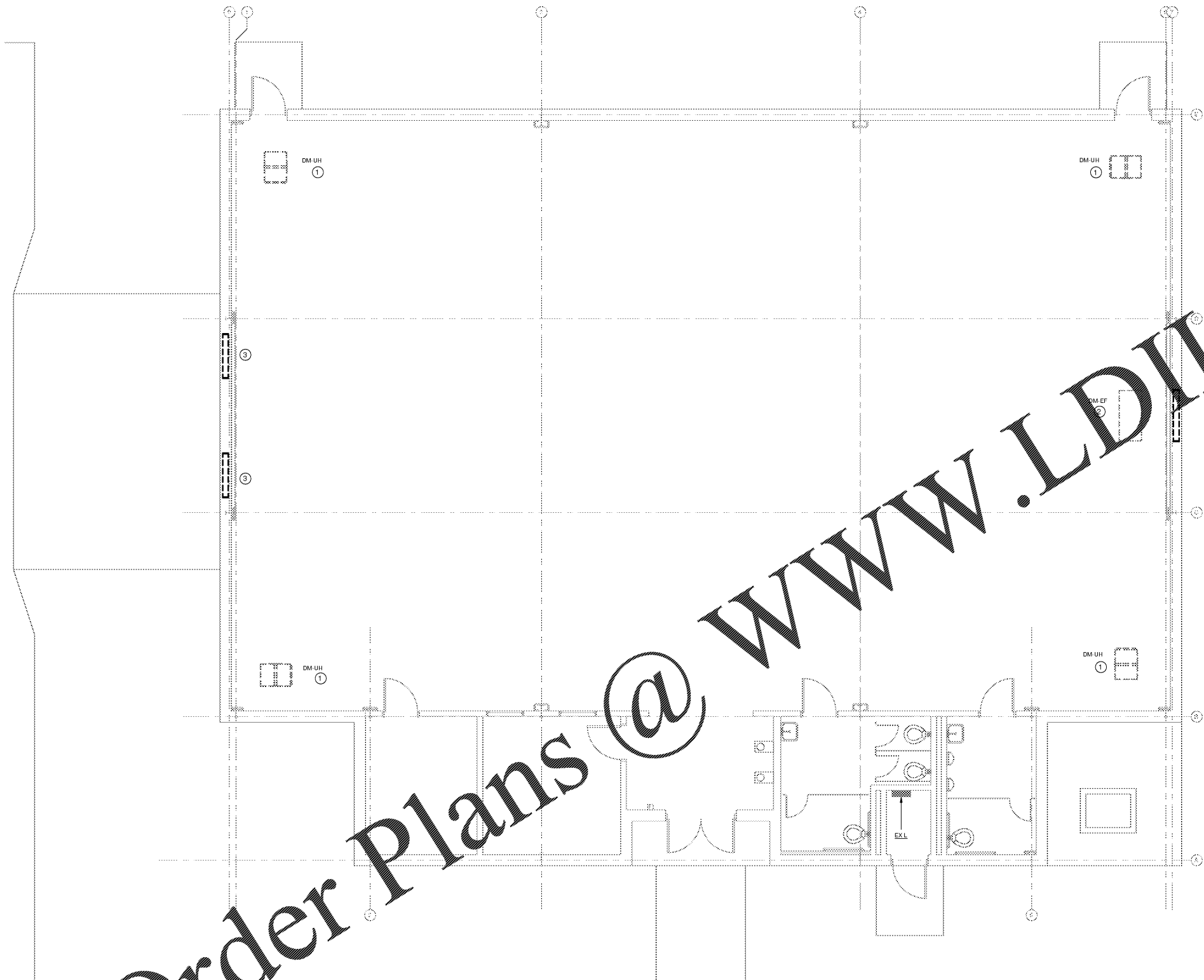
LEVEL 1 POWER DEMOLITION PLAN SCALE: 1/4" = 1'-0"