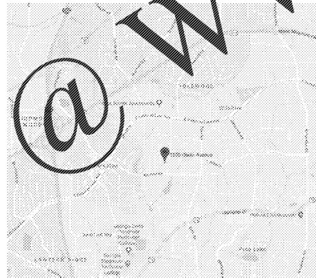
JOLLY ELEMENTARY SCHOOL DISTRICT MAP