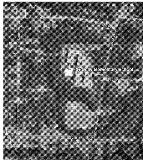
JOLLY ELEMENTARY SCHOOL AERIAL MAP