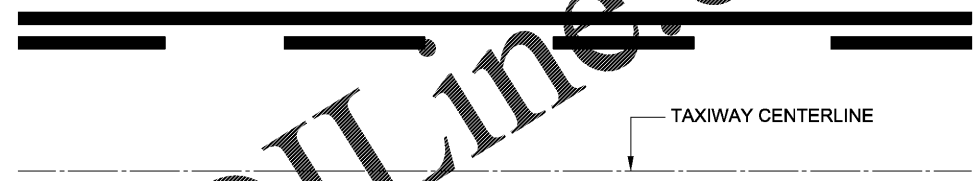
NON-MOVEMENT AREA BOUNDARY MARKING NOT TO SCALE

MARKINGS: (1) 6" WIDE SOLID LINE AND (1) 6" WIDE DASHED LINE (REFLECTIVE YELLOW) SPACED 6" APART DASHES ARE 3' IN LENGTH AND SPACES ARE 3' IN LENGTH