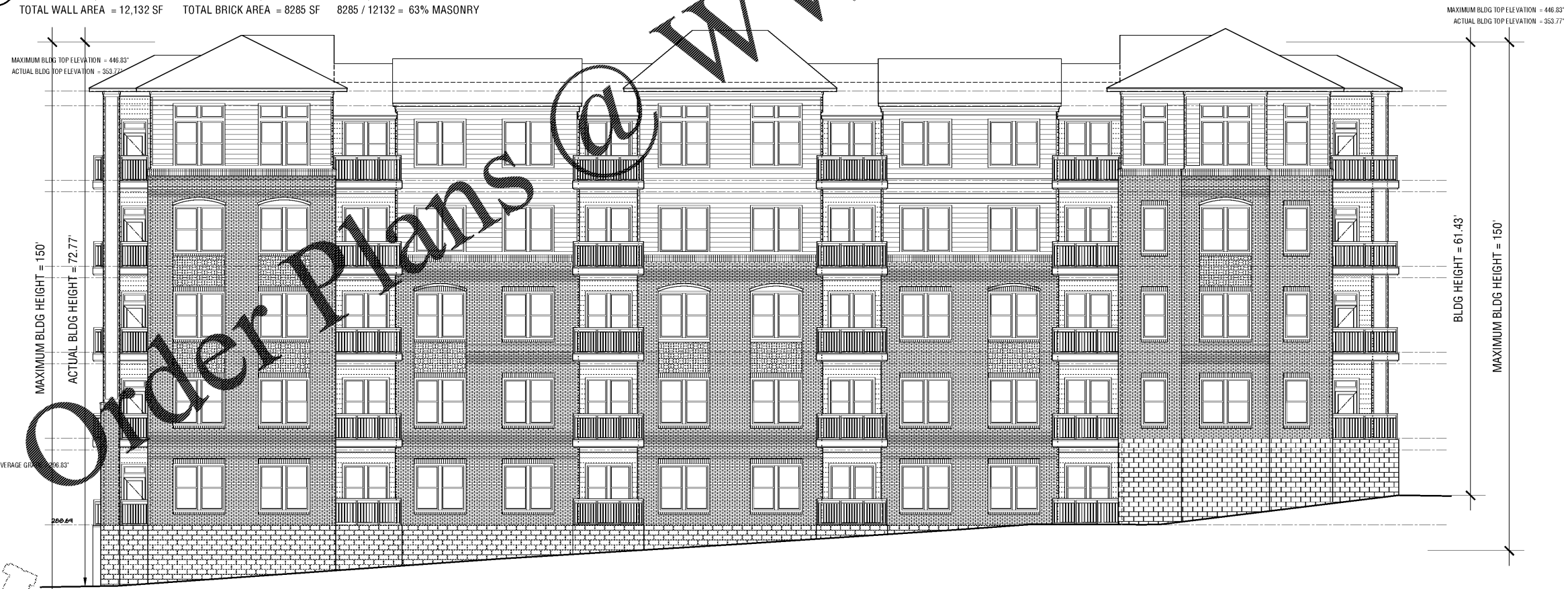
2 CHARLES DRIVE LEFT WING ELEVATION END A5.05 THIS ELEVATION, FACING THE BACK INTERIOR DRIVE, NOT FACING A PUBLIC STREET, IS REQUIRED TO HAVE 50% MASONRY. TOTAL WALL AREA = 8252 SF TOTAL BRICK AREA = 5987 SF 4611 / 6095 = 73% MASONRY