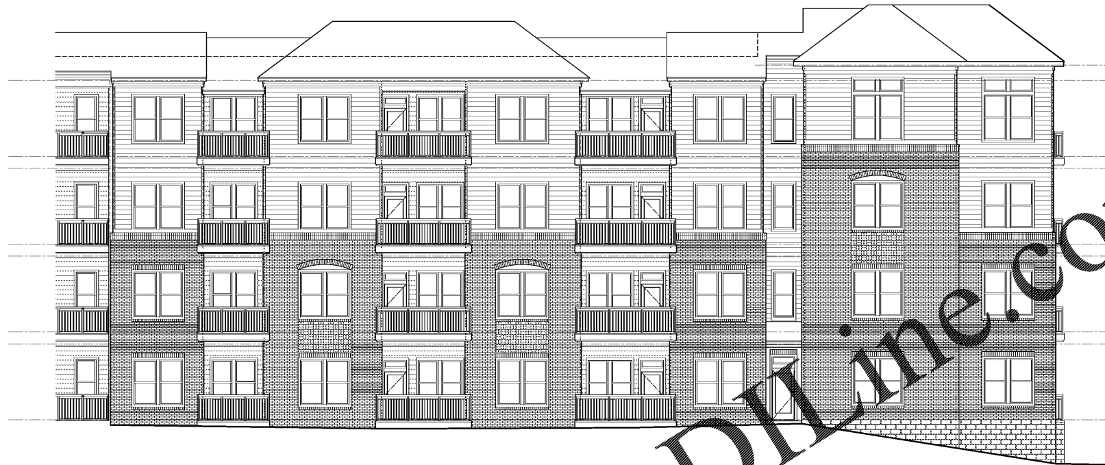
1 POOL WING ELEVATION - RIGHT A5.03 THIS ELEVATION, FACING THE BACK INTERIOR DRIVE, NOT A PUBLIC STREET, IS REQUIRED TO HAVE 50% MASONRY. TOTAL WALL AREA = 4461 SF TOTAL BRICK AREA = 2990 SF 2990 / 4461 = 67% MASONRY