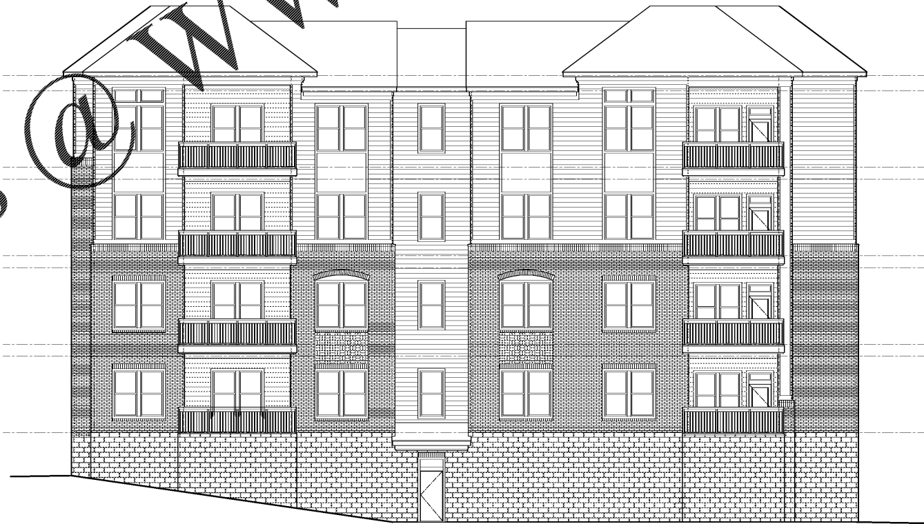
2 POOL WING ELEVATION - END A5.03 THIS ELEVATION, FACING THE BACK INTERIOR DRIVE, NOT A PUBLIC STREET, IS REQUIRED TO HAVE 50% MASONRY. TOTAL WALL AREA = 4694 SF TOTAL BRICK AREA = 2781 SF 2781 / 4694 = 59.3% MASONRY