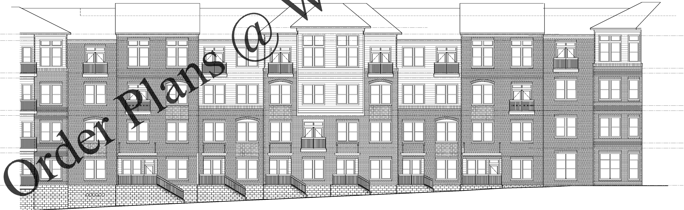
2 CHARLES DRIVE - CENTER WING ELEVATION THIS ELEVATION FACES A PUBLIC ROAD AND IS REQUIRED TO HAVE 80% MASONRY. TOTAL WALL AREA = 9553 SF TOTAL BRICK AREA = 7729 SF 7729 / 9553 = 80.9% MASONRY