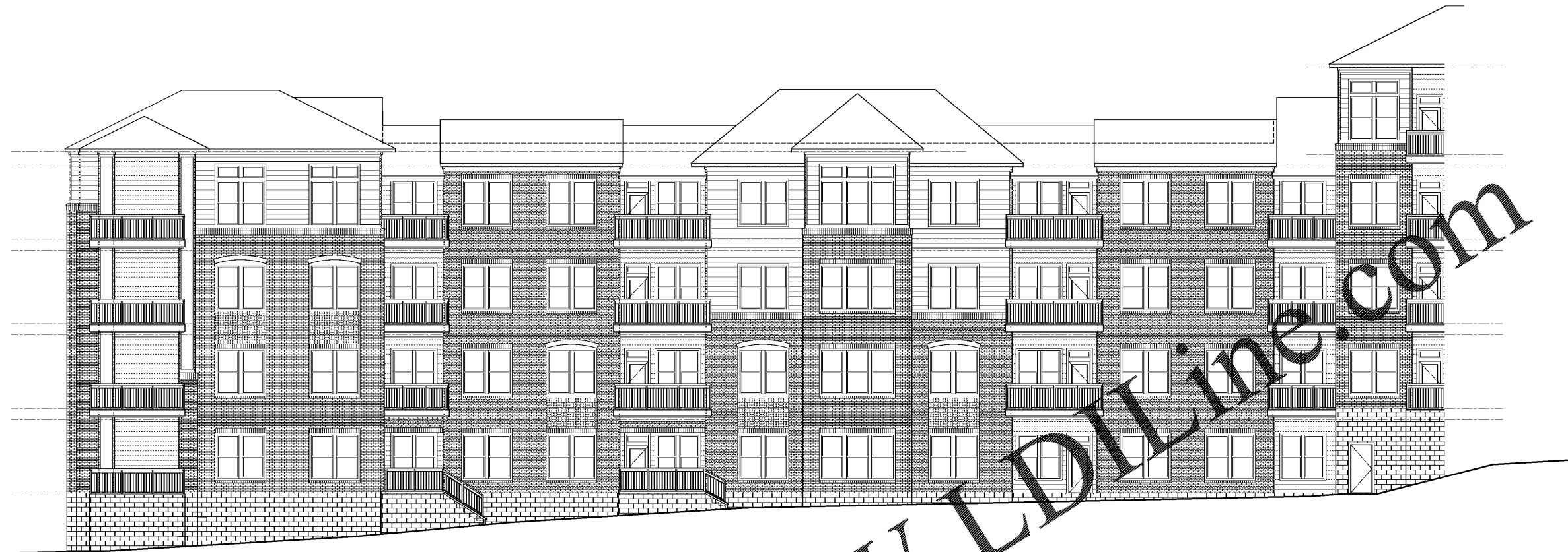
1 CHARLES DRIVE - LEFT WING ELEVATION THIS ELEVATION FACES A PUBLIC ROAD AND IS REQUIRED TO HAVE 80% MASONRY. TOTAL WALL AREA = 6982 SF TOTAL BRICK AREA = 5856 SF 5856 / 6982 = 82.8% MASONRY