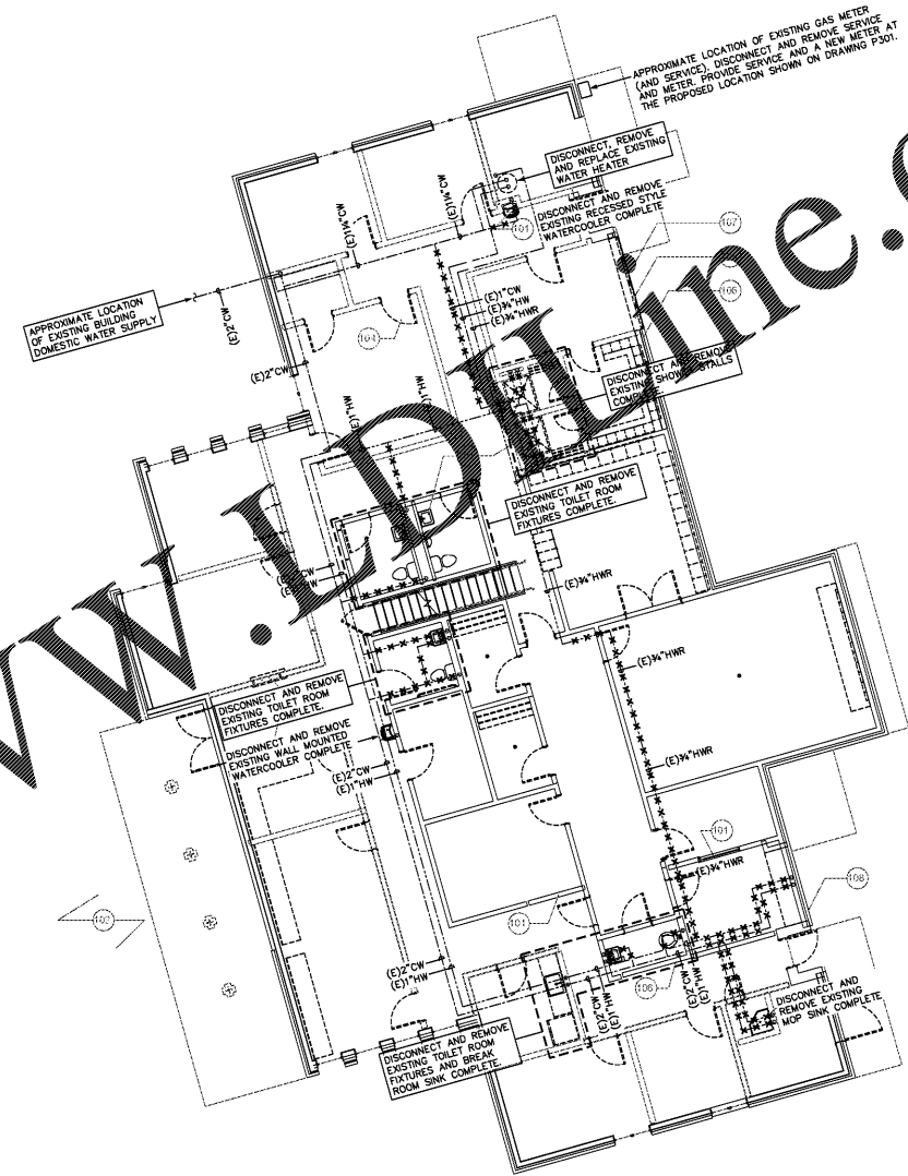
② WATER SUPPLY DEMOLITION PLAN - PLUMBING 1/8" = 1'-0"

NOTE ABOUT EXISTING UNDER-SLAB PIPING: REMOVE EXISTING UNDER-SLAB WASTE PIPING COMPLETELY WHEN IT WILL INTERFERE WITH THE INSTALLATION OF NEW PIPING. OTHERWISE DRAIN, CAP AND ABANDON IN PLACE.