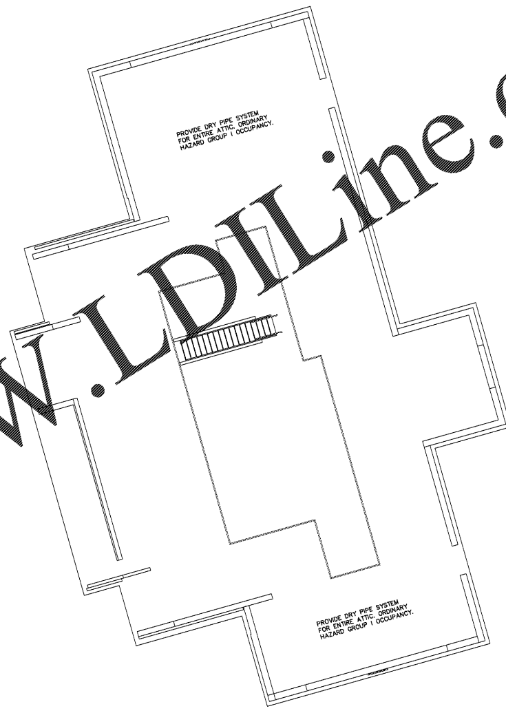
EXISTING BUILDING SPRINKLER SYSTEM MEZZANINE/ATTIC PLAN - FIRE PROTECTION ① 1/8" = 1'-0"