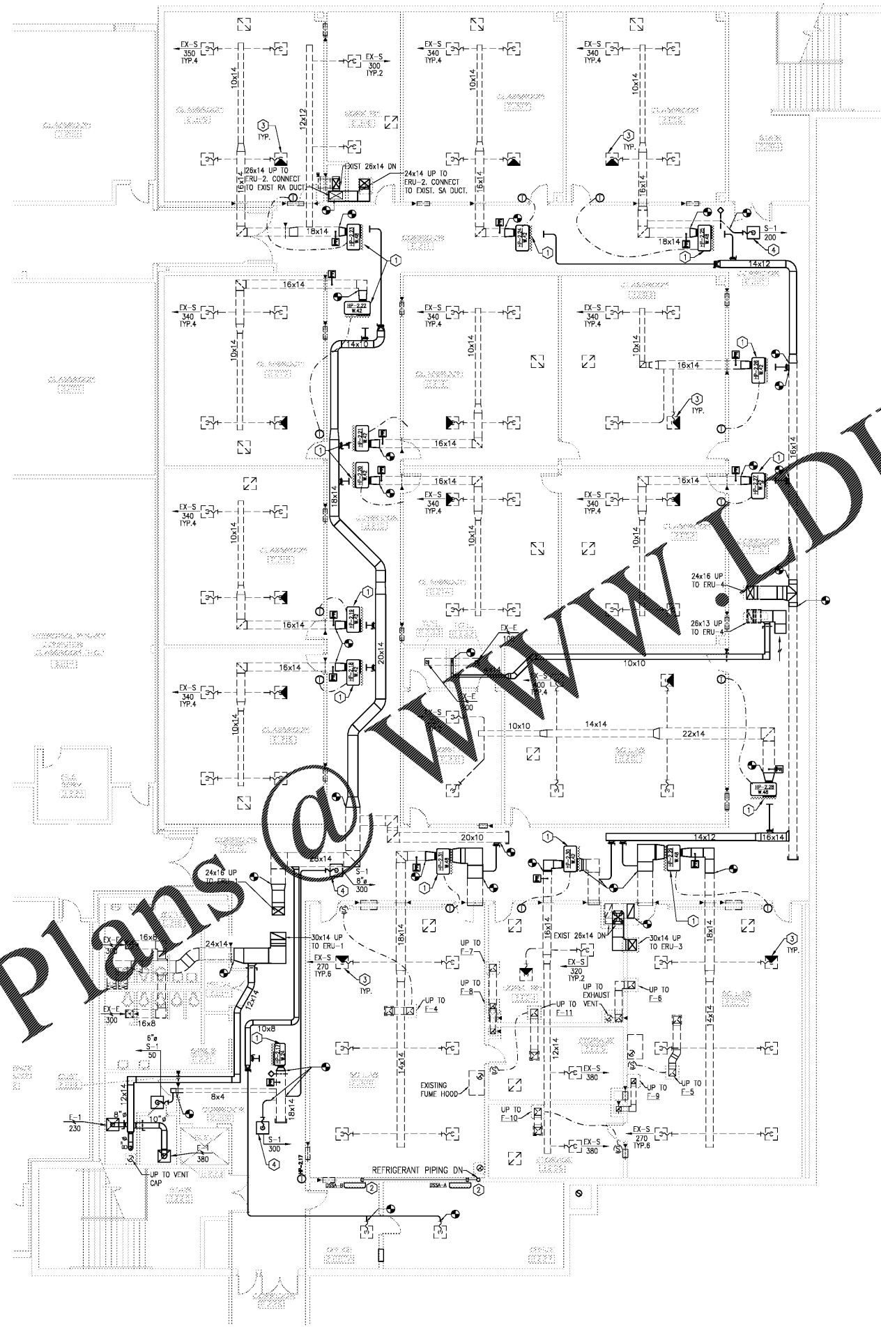
1 SECOND FLOOR HVAC NEW WORK PLAN W2.12 SCALE: 1/8" = 1'-0"