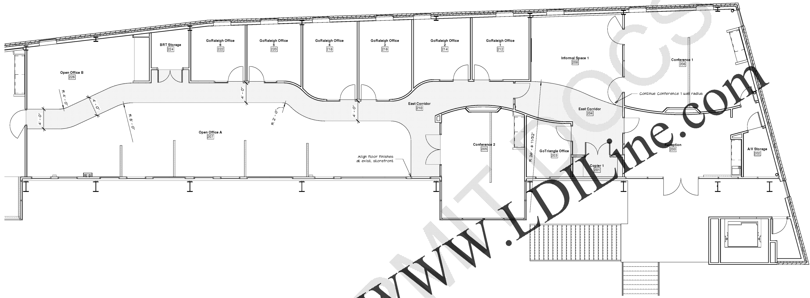
1 FLOOR PLAN - LOWER MEZZANINE - EAST FLOOR FINISH 3/16" = 1'-0"

Union Station Mezzanine Office Fit Up City of Raleigh Transit Division 510 W Martin St, Raleigh, NC 27601