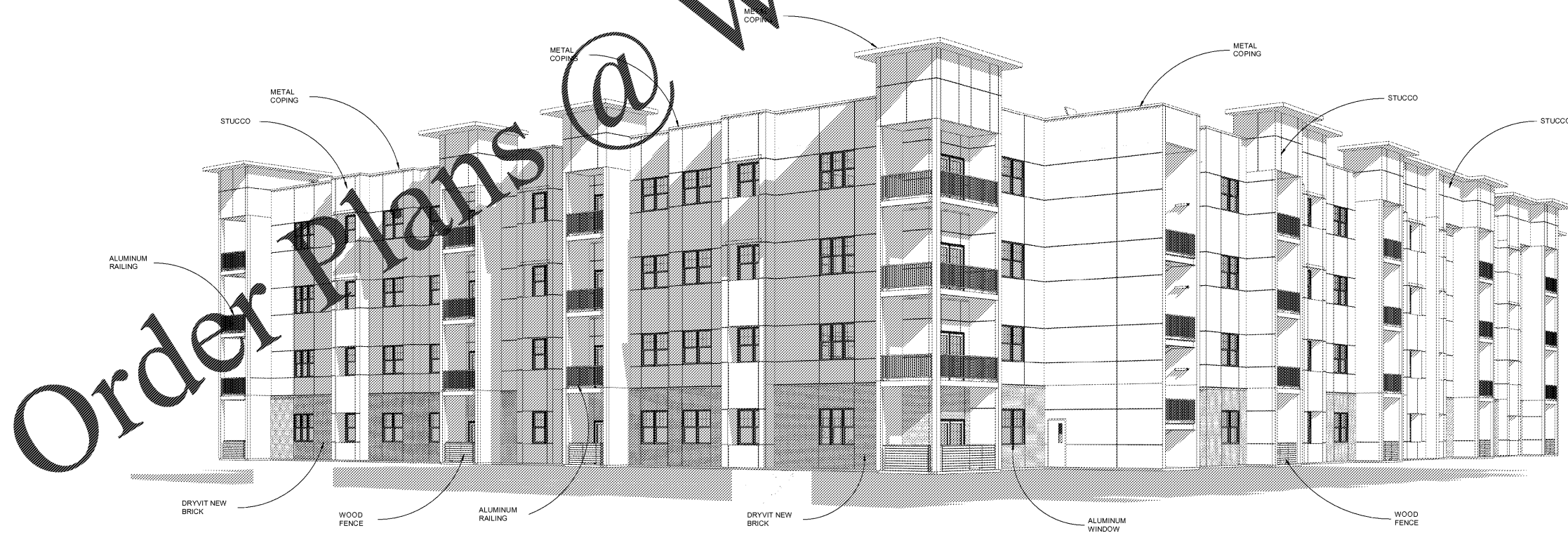
1 EXTERIOR PERSPECTIVE 03

1925 Prospect Ave. Orlando, FL 32814 P (407) 661-9100 F (407) 661-9101 www.r.p.com