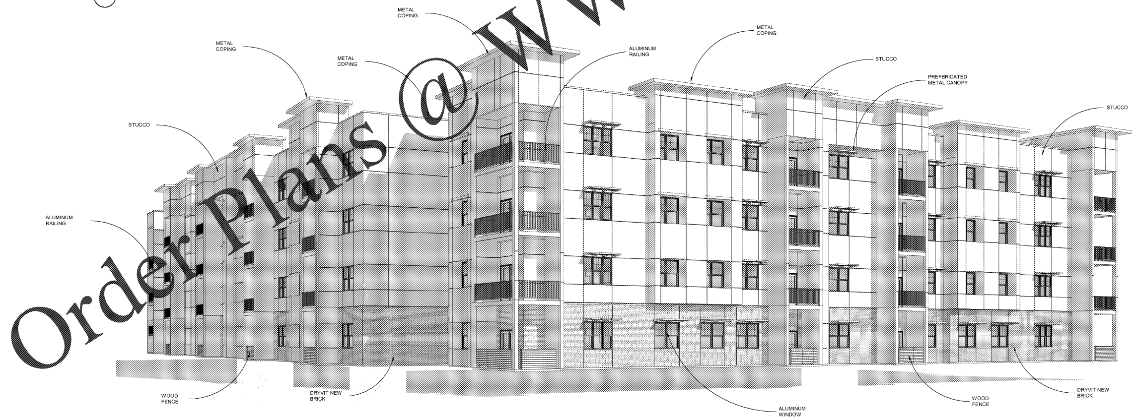
1 EXTERIOR PERSPECTIVE 01

1925 Prospect Ave. Orlando, FL 32814 P (407) 661-9100 F (407) 661-9101 www.r.p.a.com