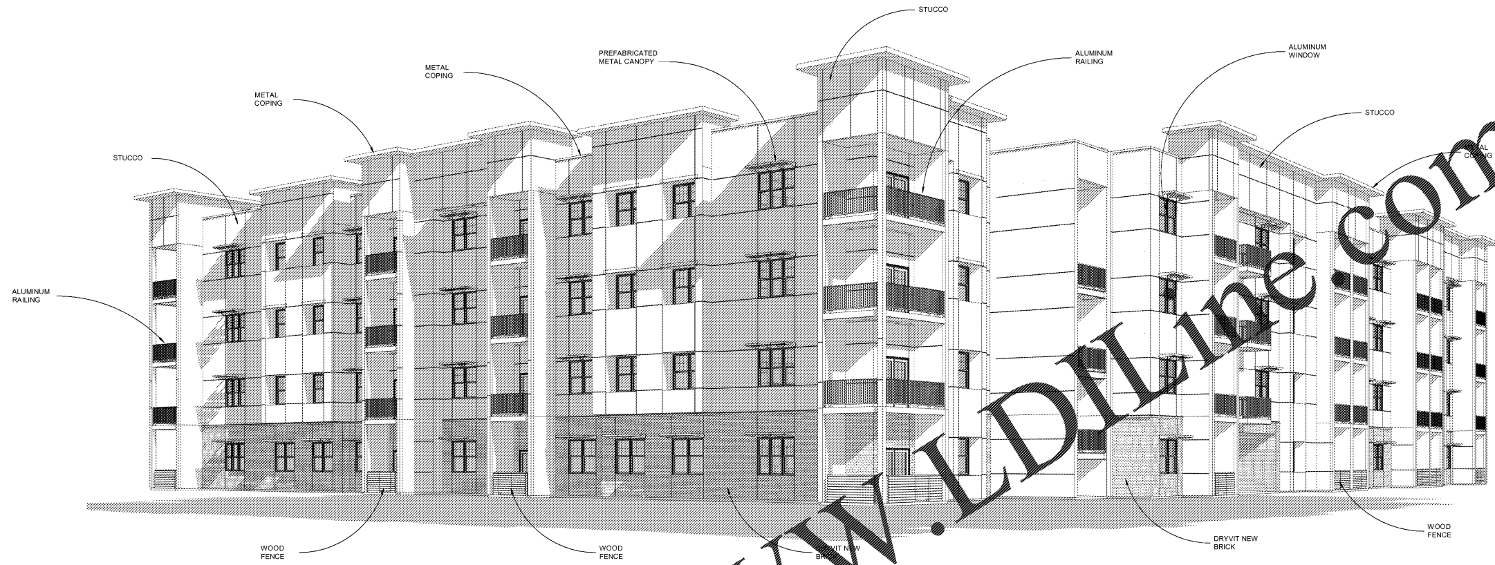
2 EXTERIOR PERSPECTIVE 02