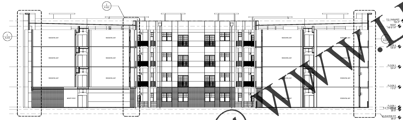
2 BUILDING SECTION - EAST-WEST- CAVE 3/32" = 1'-0"