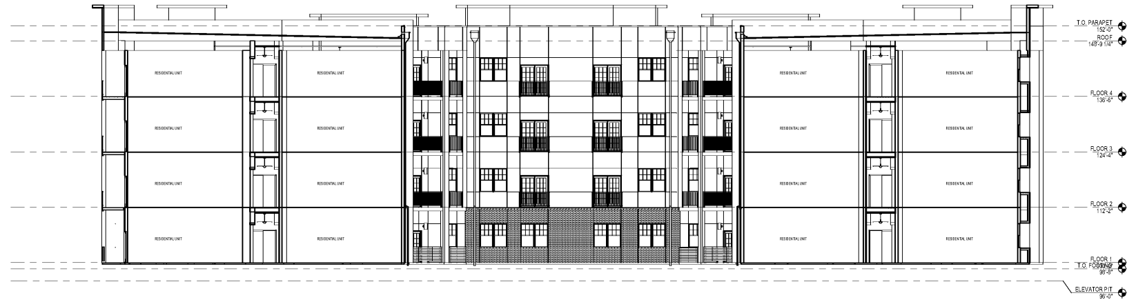
3 BUILDING SECTION- EAST- WEST- UNIT 3/32" = 1'-0"