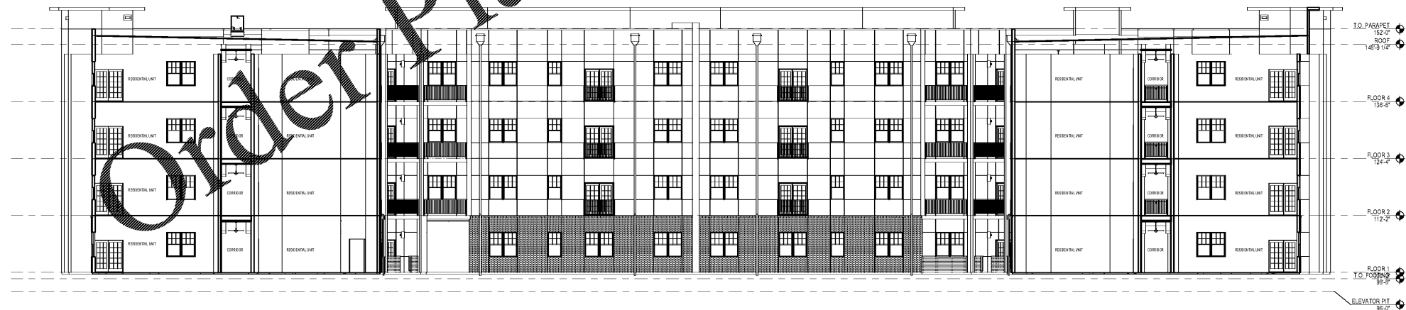
1 BUILDING SECTION - NORTH - SOUTH 3/32" = 1'-0"