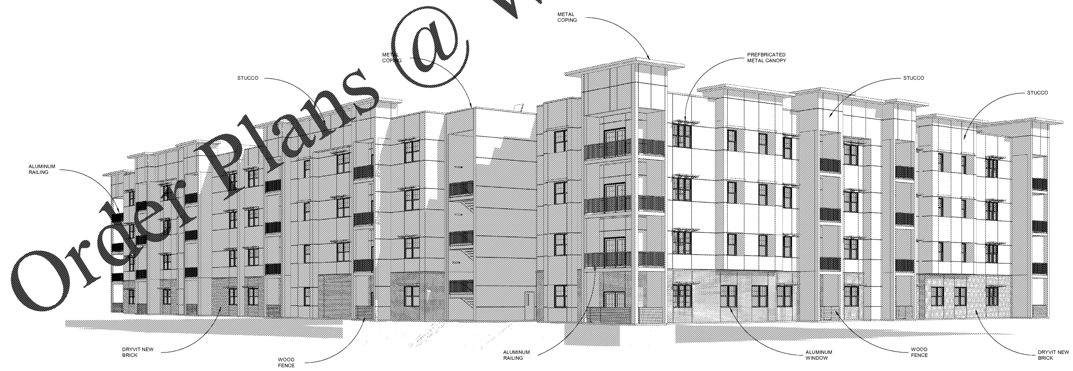
1 EXTERIOR PERSPECTIVE 01