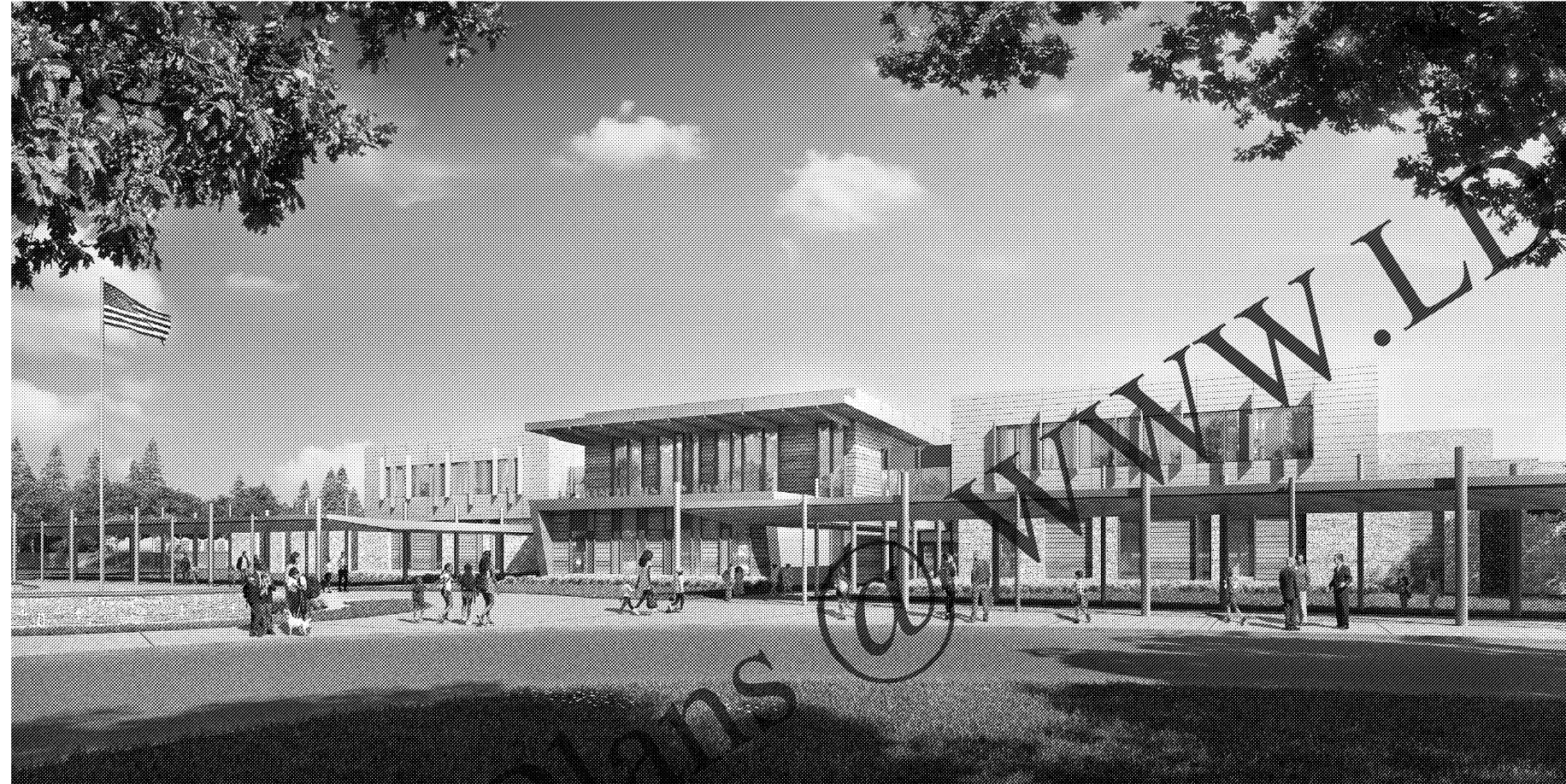
NOTE: ARTIST RENDERING MAY NOT REPRESENT WHAT IS ACTUALLY BUILT