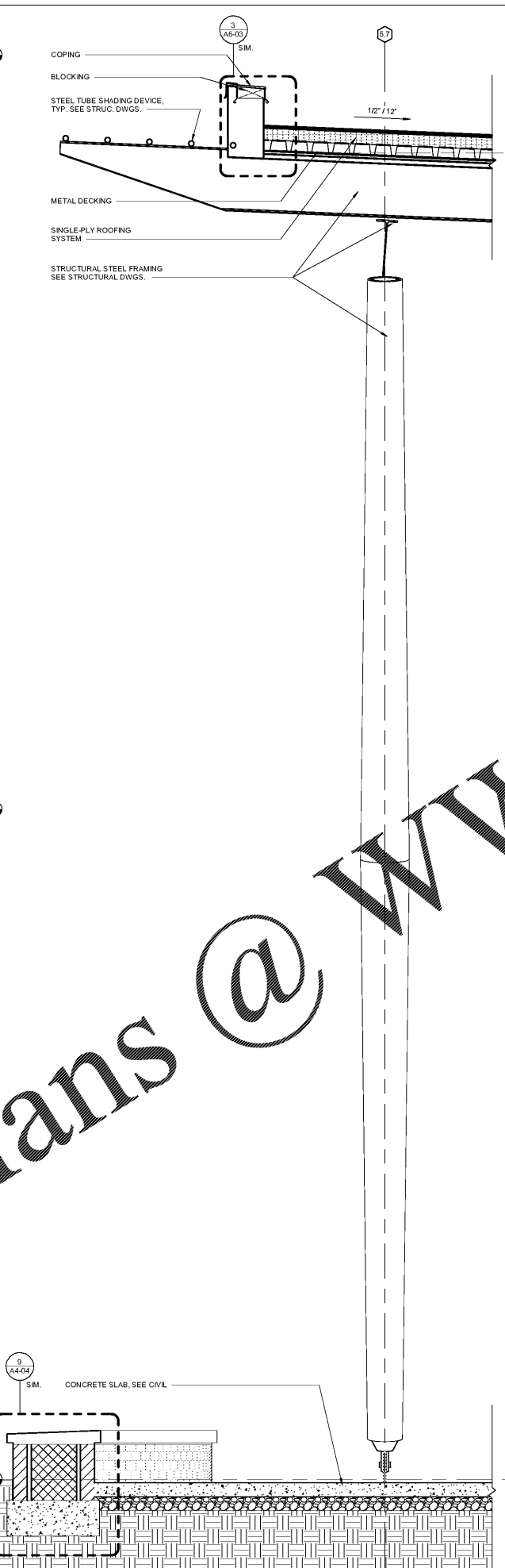
2 WALL SECTION AT MEDIA CENTER - 1 A3-15 3/4" = 1'-0"