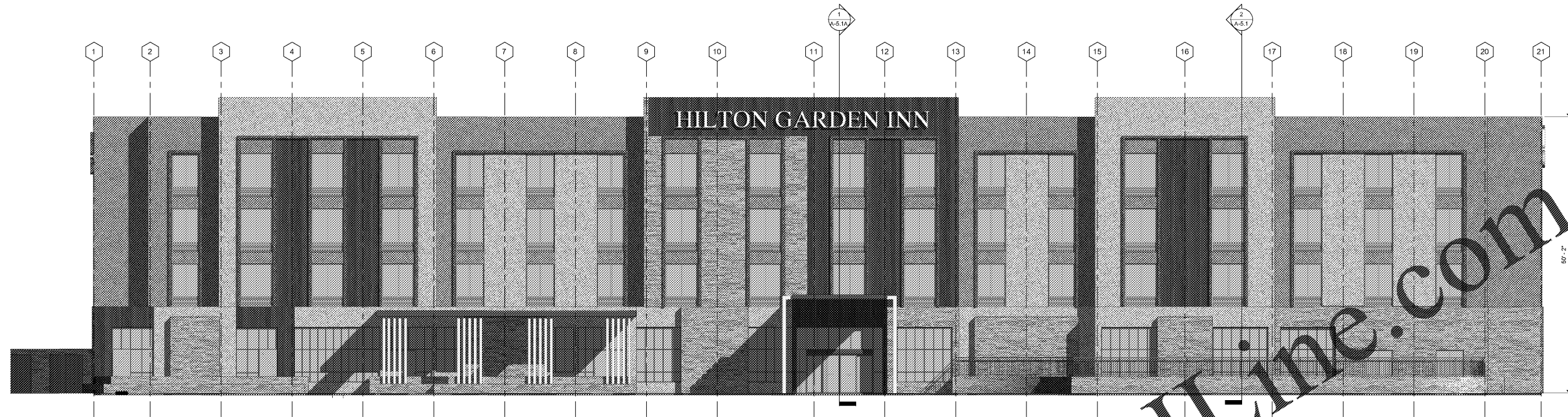
1 SOUTH ELEVATION COLOR SCALE: 1/8" = 1'-0"