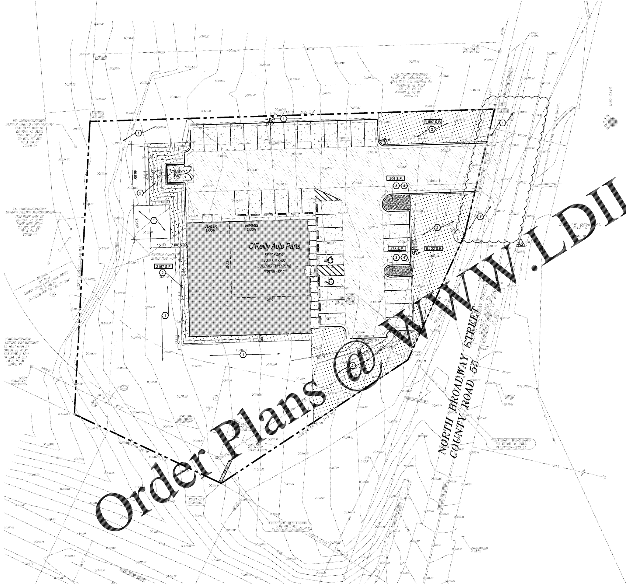
1 LANDSCAPE PLAN L1.1 SCALE: 1" = 20'-0"