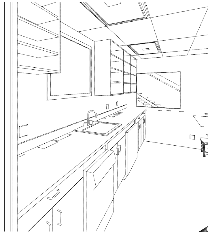
5 C-5 102 NON-STER. NEUTR. ID-5.4