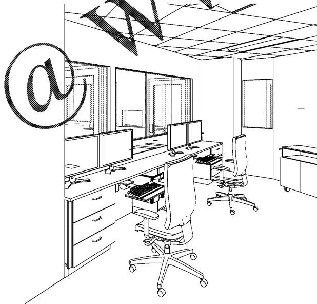
2 C-1 104-STERILE PREP VIEW 2 ID-5.4