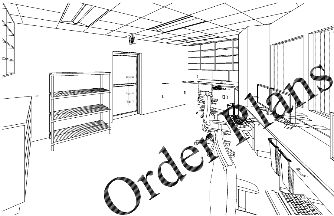
3 C-2 104-STERILE PREP VIEW ID-5.4