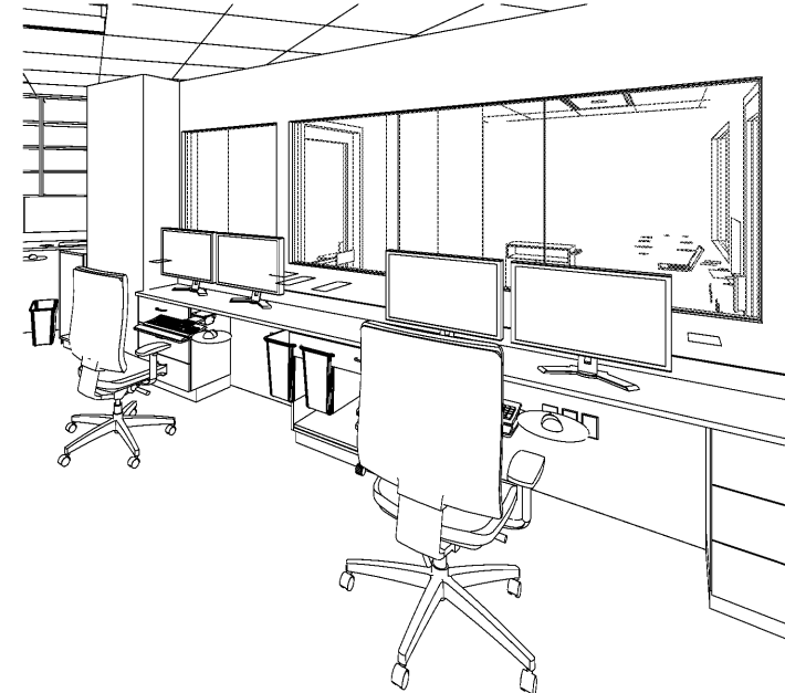
1 C-1 104-STERILE PREP VIEW 1 ID-5.4