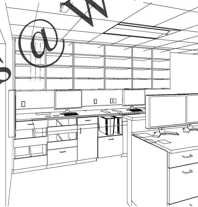
2 F-1 101-VERIF/DISPENS 2 ID-5.3