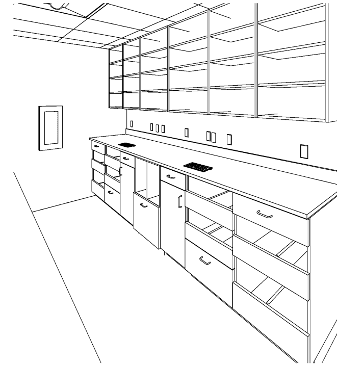
1 F-1 101-VERIF/DISPENS 1 ID-5.3