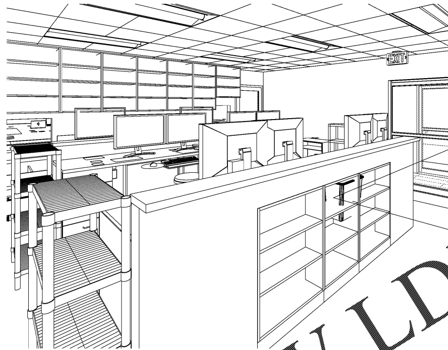
4 V-1 101-VERIF/DISPENS 2 ID-5.3