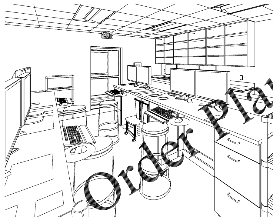
3 V-1 101-VERIF/DISPENS 1 ID-5.3